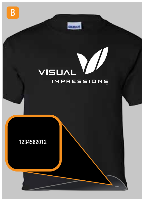
OPTION 2: FEE TYPE ART - EXTRA LOCATION. (EXAMPLE-INSIDE HEM).