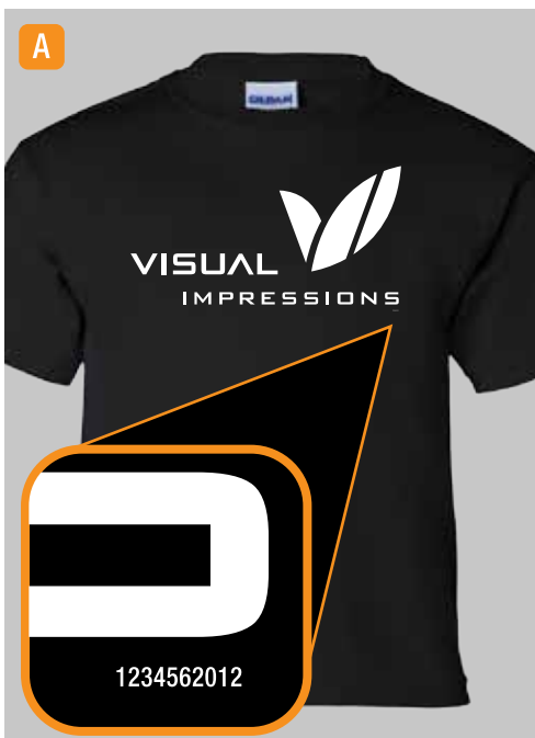
OPTION 1: FREE TYPE ART - WITH DESIGN.

Another requirement of the CPSIA is the addition of adding a permanent tracking label to all youth apparel. The regulation does not mandate any standards for applying the label, or any guidelines for size or format. The intent is to identify the product should there be a need for a recall, and as Visual Impression is considered the final manufacturer in the supply chain, we are required by law to complete this part of the process. As Visual Impressions is a contract printer, and our business information is proprietary we are using our internal Work Order Number with the Month / Year as the cohort information to precisely identify a product in a recall situation. To facilitate this we are offering a free method of adding the tracking label information which will entail adding a small set of numbers underneath one of the print locations. As this can be handled with our art department and doesn't require any extra production effort, we can do this without any additional cost to our customers. If you feel aesthetically this would not work with your design, we can add the same information somewhere to the inside of the garment on a hem for an additional $0.35 per shirt. See below for examples.